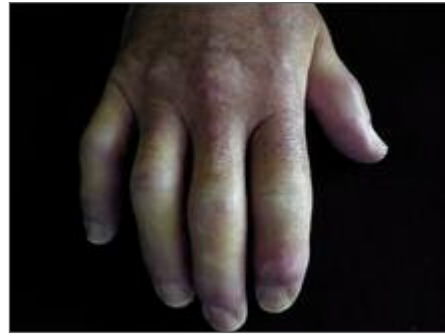
FIGURE 2. Sclerodactyly, PIP oligoarthritis