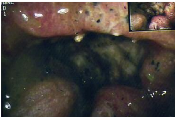
FIGURE 3. Colonoscopy showing a tumoral mass