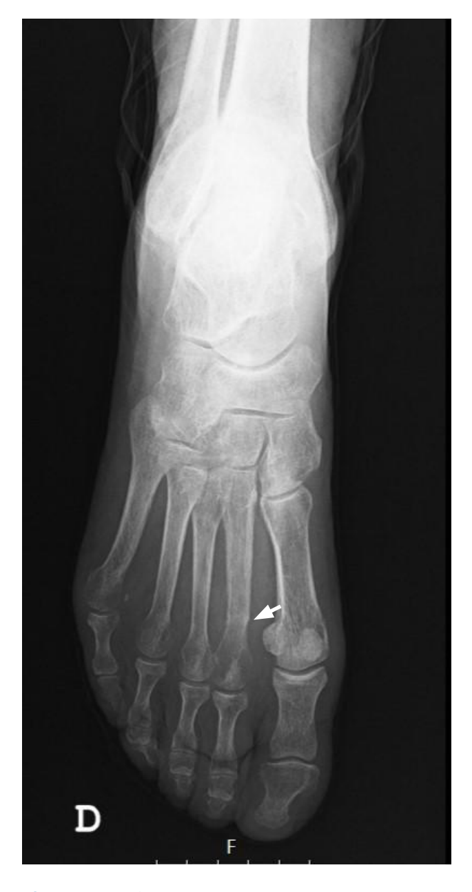
Figure 1. Right foot plain X-ray revealing a 2nd metatarsal bone fracture (white arrow).

Case 1: A 57-year-old female was admitted to the outpatient clinic for sudden atraumatic disabling foot pain evolving for 2 weeks, refractory to treatment with nonsteroidal anti-inflammatory drugs. She had a diagnosis of Rendu-Osler-Weber syndrome conditioning chronic iron-deficiency anemia and requiring multiple infusions of FCM (cumulative dose of 12g) and red blood cell transfusions in the previous 3 years. Right foot plain X-ray revealed a 2nd metatarsal bone fracture (Figure 1). Hypophosphatemia (1,2 mg/dL), vitamin D deficiency (2.3 µg/dl), increased alkaline phosphatase