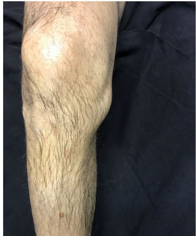
Figure 1A. Clinical appearance of the patient knee

MRI revealed a conspicuous cystic ovoid lesion, 3.05 cm in widest diameter, compatible with a parameniscal