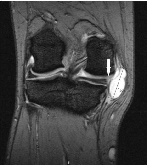
Figure 1C. A T2* Multi-GRE MRI sequence showing an ovoid cystic lesion with 3.05cm in the longest axis, compatible with a parameniscal cyst.