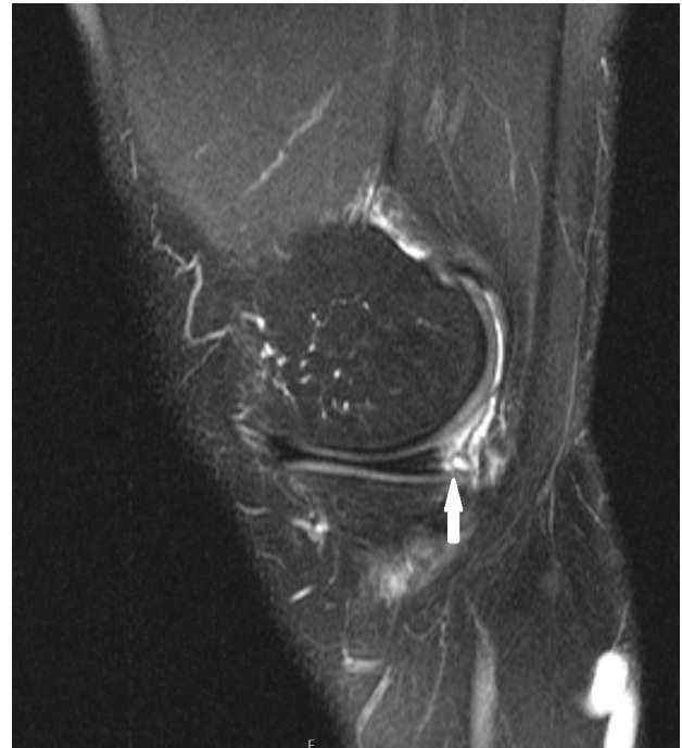
Figure 1D. A T2* Fat Suppression MRI sequence showing structural heterogeneity of the posterior horn of the internal meniscus, with a longitudinal fracture at this level, intercepting the inferior articular surface

cyst (Figure 1C). This was associated with structural heterogeneity of the posterior edge of the internal meniscus with a longitudinal fracture (white arrow) at this level, intercepting the inferior articular surface (Figure 1D). The patient had only mild pain and no disability. He declined surgery and conservative treatment was offered.