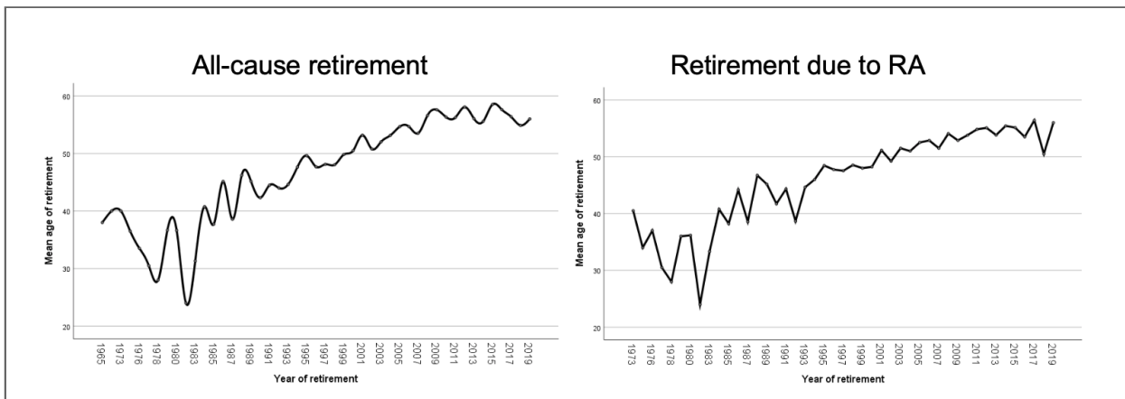
FIGURE 2. Evolution of the mean age of retirement of RA patients over the years

Legend: ACPA: anti-citrullinated protein antibody; NA: non-applicable SD: standard deviation; RA: rheumatoid arthritis.