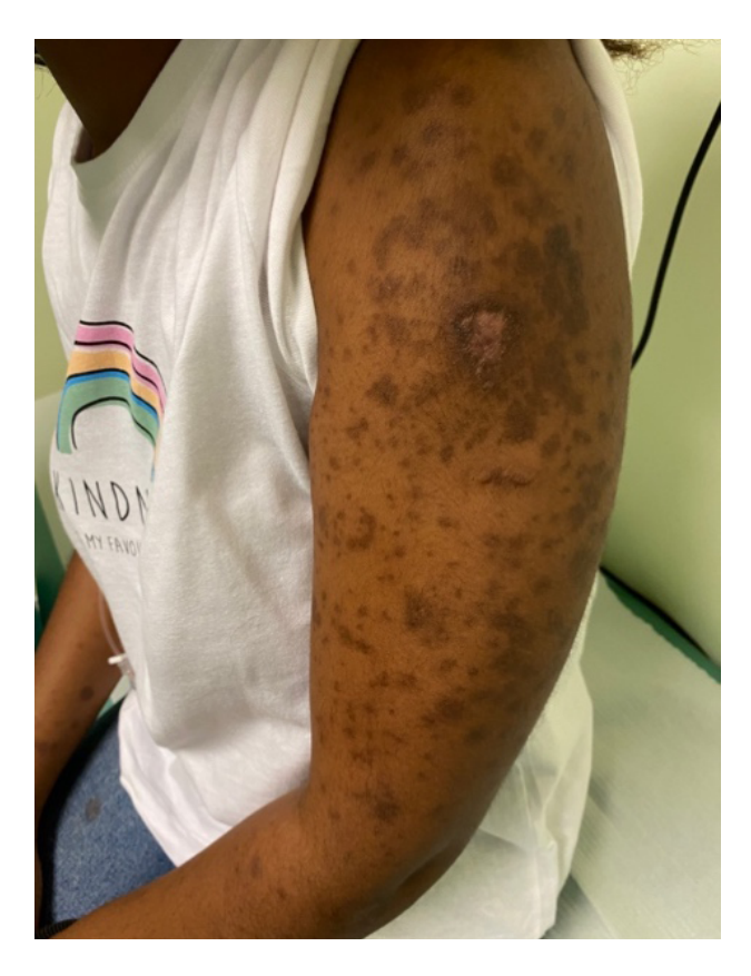
Figure 1. Hyperpigmented lesions of the left upper limb

in the submental, cervical and supraclavicular areas, and splenic heterogeneity, with small hypodense nodes. ELNB revealed loss of architecture, extensive necrosis and inflammatory infiltrate with numerous histiocytes, compatible with KFD.