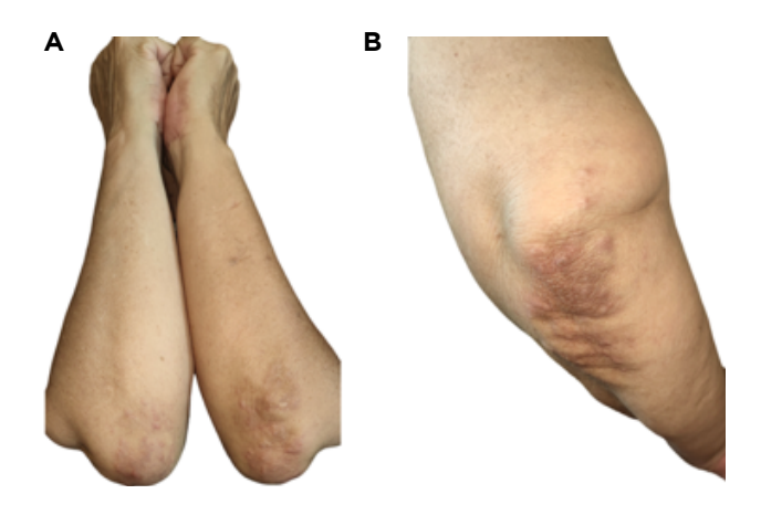
Figure 1. a) Extensor surface of the forearms. Multiple erythematous-violaceous papules and nodules, sometimes subcutaneous, tending to coalesce into plaques, with a hard-elastic consistency and mobile, symmetrically distributed on the elbows. b) Close-up image.

PNGD is a rare inflammatory dermatosis of unknown cause, often asymptomatic, presenting as skin-colored to erythematous papules or plaques on extremities, particularly extensor surfaces<sup>2,3</sup>. These features make it difficult to distinguish from rheumatoid nodules in RA patients, leading to undertreatment and increased morbidity. High clinical suspicion and referral to Dermatology are crucial. Key differences include PNGD's possible pruritus and softer consistency, whereas rheumatoid nodules are non-pruritic, firmer, and develop on pressure points like hands and fingers. Another relevant differential diagnosis is accelerated nodulosis, commonly seen in RA patients on methotrexate, characterized by rapid growth of rheumatoid nodules<sup>(3)</sup>. PNGD is commonly associated with RA, systemic lupus erythematosus, or systemic vasculitis, and has not been