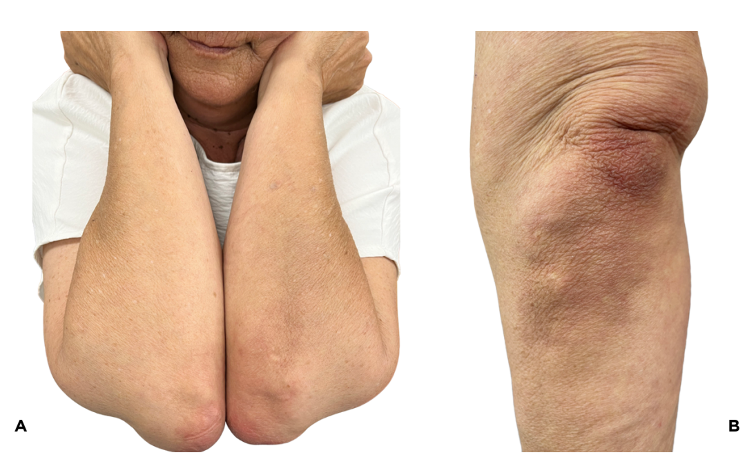
Figure 4. a) Extensor surface of the forearms. Almost complete resolution of skin lesions after treatment with clobetasol cream. b) Close-up image.