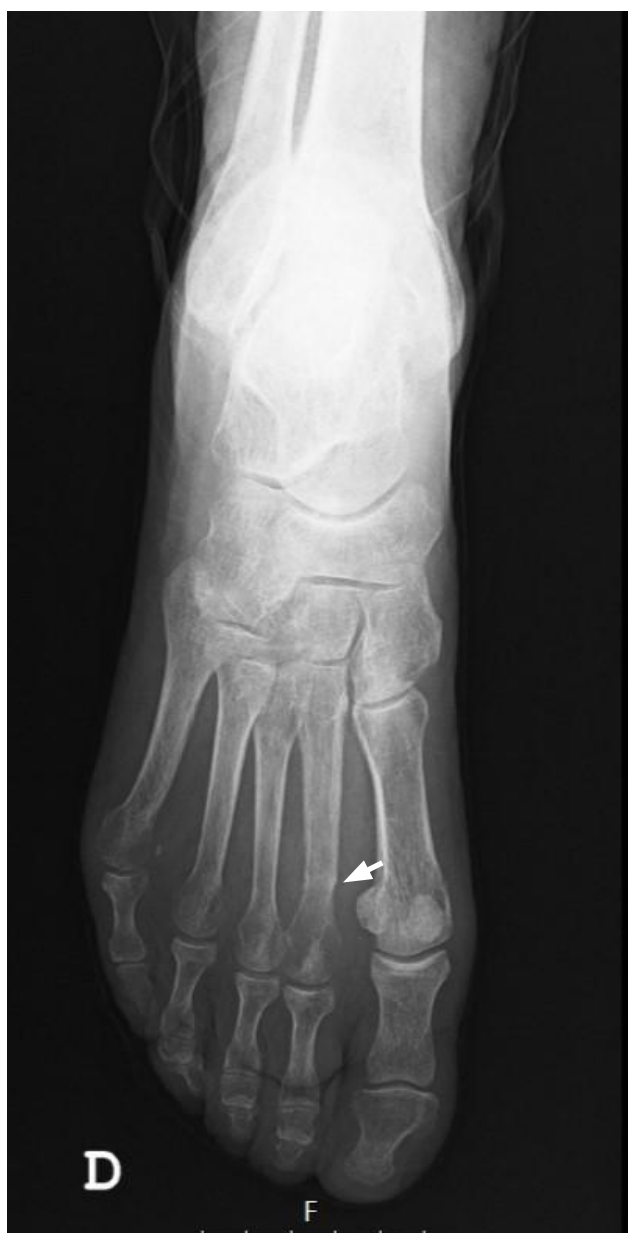
Figure 1. Right foot plain X-ray revealing a 2nd metatarsal bone fracture (white arrow).

Case 1: A 57-year-old female was admitted to the outpatient clinic for sudden atraumatic disabling foot pain evolving for 2 weeks, refractory to treatment with nonsteroidal anti-inflammatory drugs. She had a diagnosis of Rendu-Osler-Weber syndrome conditioning chronic iron-deficiency anemia and requiring multiple infusions of FCM (cumulative dose of 12g) and red blood cell transfusions in the previous 3 years. Right foot plain X-ray revealed a 2nd metatarsal bone fracture (Figure 1). Hypophosphatemia (1,2 mg/dL), vitamin D deficiency (2.3 µg/dl), increased alkaline phosphatase